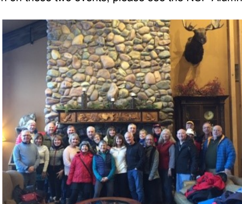
Just some of the 40+ alumni and family at the 2020 Alumni Celebration event in Whitefish, MT.

For more information on these two events, please see the NSP Alumni website.