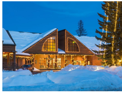
Rooms at the Grouse Mountain Lodge will be reserved.