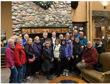
Alumni members gather in Grouse Mountain Lodge, Whitefish.