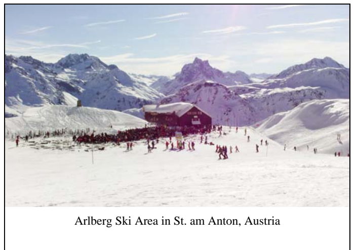
Arlberg Ski Area in St. am Anton, Austria