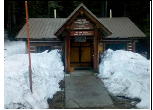
Willamette Backcountry Ski Patrol Cabin at Gold Lake